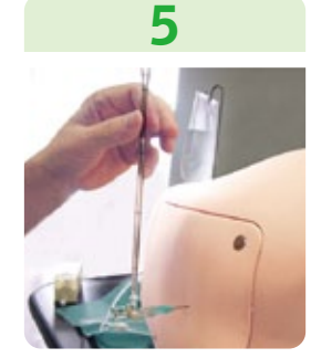
5 CSF collection and CSF pressure measurement