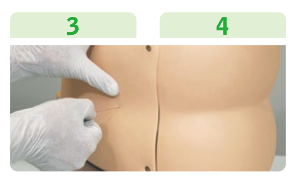
3 Landmark guided lumbar puncture4 Landmark guided epidural procedure