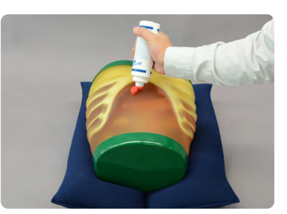
2. Spread lubricant gel on the phantom body.