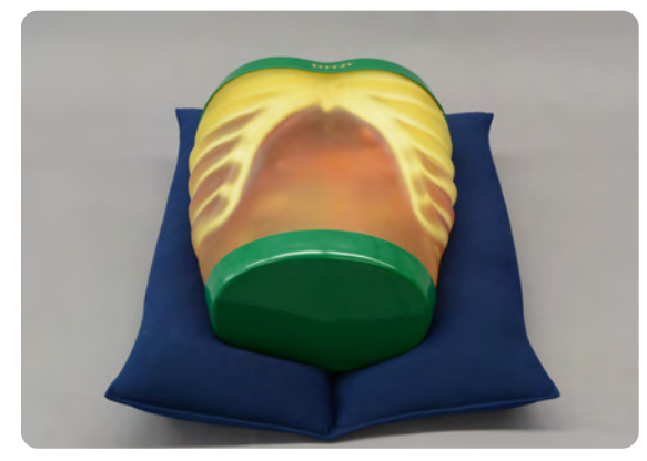
1. Place the phantom stably on the positioning pillow.