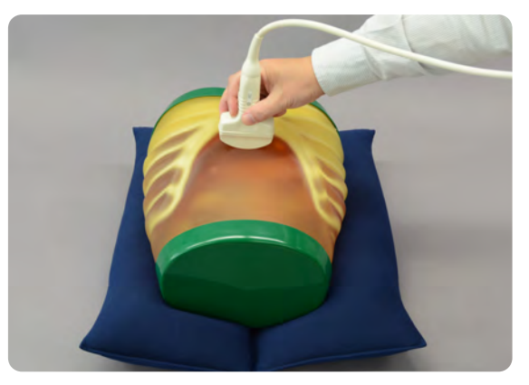
The phantom can be scanned with real ultrasound devices.