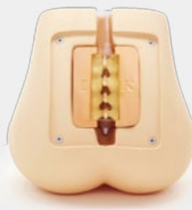
Landmark Guided Lumbar Puncture