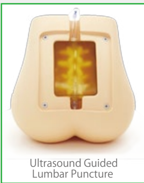
Ultrasound Guided Lumbar Puncture

Replacement parts are durable for multiple procedures.