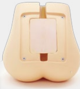
Fluoroscopy Guided Lumbar Puncture