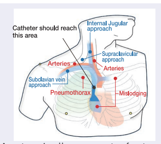
Anatomically accurate features including 3 insertion sites and rib cage